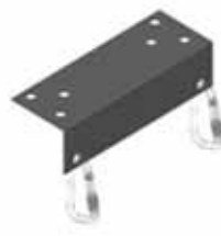
Low ceiling MC