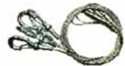
Wire hanging kit