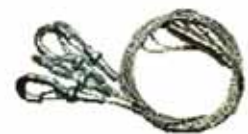
Wire hanging kit