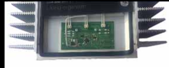
SES Lighting radio dimming transmitter