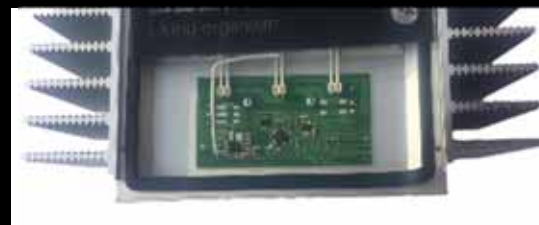
SES Lighting radio dimming transmitter