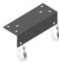
Low ceiling MC