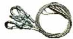
Wire hanging kit